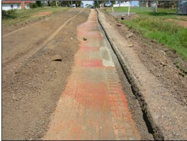
Figure 6 After the removal of the pavement material the subgrade will be exposed allowing the opportunity to repair the subgrade rather than risk pavement distress at a later date.