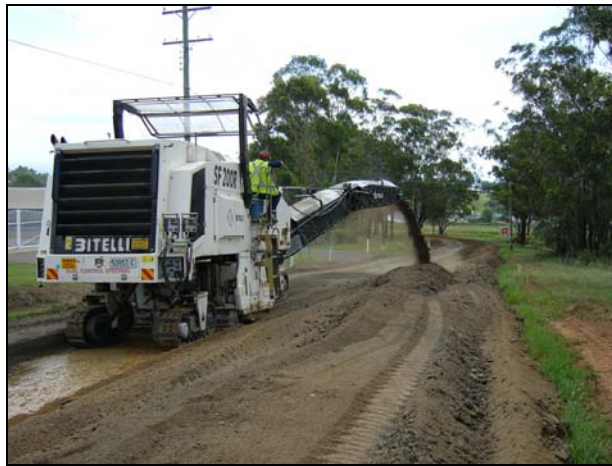
Figure 2 Sidecasting of pavement material using a 2 m wide profiler.