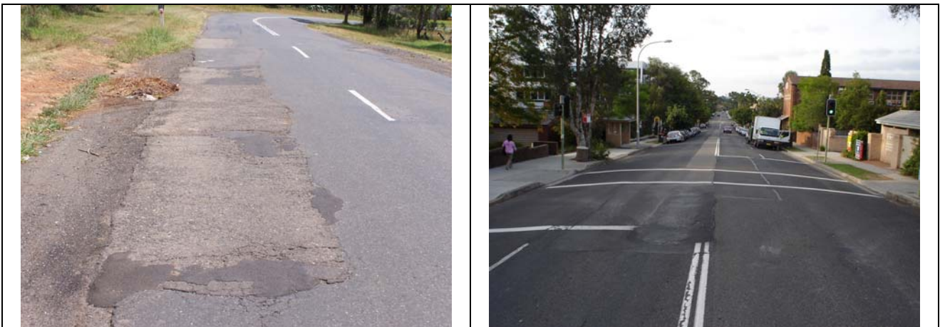
Figure 1 Candidates for crossblending of road materials prior to stabilisation.

The performance of insitu and plant-mix stabilisation methods relies on many factors, with one of them being the uniformity of the host material or at least identifying the changes in uniformity to allow other design factors to be taken into consideration. Often distressed pavements include asphalt patches of varying thicknesses and frequency that if not removed or treated appropriately will reduce the success of stabilisation reaching its full potential (see Figure 1).