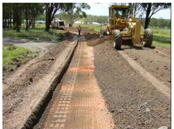
Figure 5 Pushing the blended material back into the boxed pavement area.

A grader and/or skidsteer is often used to push the side cast material back into differing excavated area/s as shown in Figure 5.