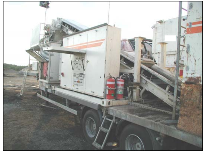
Figure 4 View of two 9 kg fire extinguishers mounted on the plant for ease of access & use.

In addition, well-trained plant operators are required to ensure that the foaming operations are working during the process.