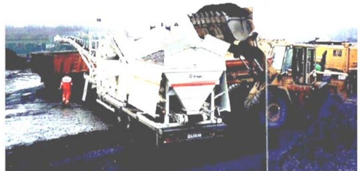
Figure 1 View of purpose built foamed bitumen plant-mix in use.

Typically pugmill-plant road stabilisation involves use of specialised equipment brought to a site near the works and the existing pavement materials are milled, stabilised and replaced, similar to that used in asphalt rehabilitation.