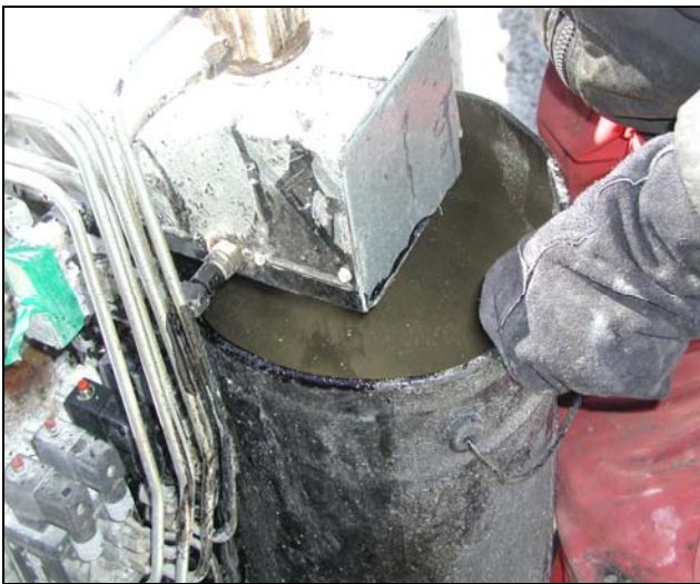
Figure 3 Operator assessing the foaming of bitumen from special inspection nozzle system on the plant.

Whilst these are the minimum requirements, other required equipment features include;