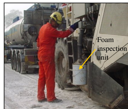
Figure 3. Operator assessing foaming nozzle operation from special inspection system on the reclaimer.