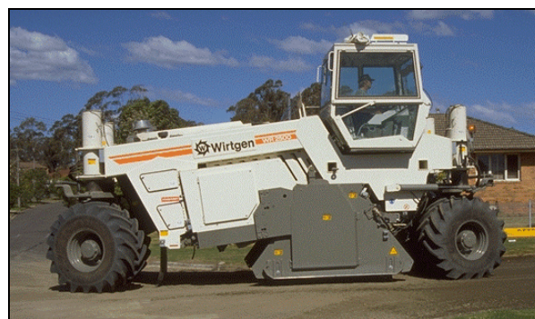
Figure 1. Dedicated reclaimer/stabiliser for insitu foamed bitumen stabilisation.

Large reclaimer/stabilisers also have the ability to pulverise existing asphalt to depths of about 75 mm and incorporate the asphalt in the final mix. In fact, the existing asphalt contains very good aggregates to enhance the strength of the stabilised layer.