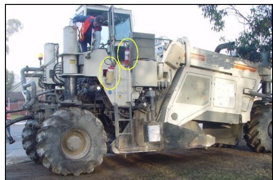
Figure 4. View of two 9 kg fire extinguisher on reclaimer.

In addition, well-trained reclaimer operators are required to ensure that the foaming operations are working during the process.